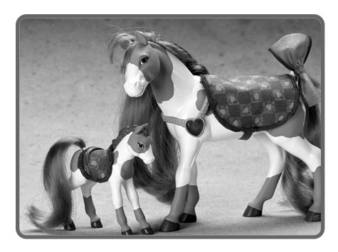
Misty & Baby Meadow 75395